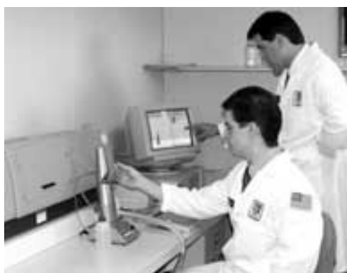
Today, most process engineers consider quantitative testing a critical step in selecting and optimizing mixing equipment. The Ross Analytical Laboratory is equipped with sophisticated instrumentation, such as this laser diffraction particle size analyzer, to measure particle/droplet size as well as size distribution.