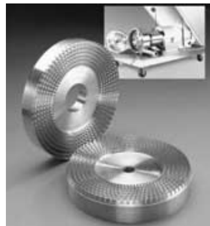
The innovative X-Series rotor/stator generator applies intense shear and produces sub-micron emulsions in a single pass – much faster than any other rotor/stator mixer.