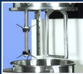
Rectangular Planetary Stirrer, High Speed Shaft with Two (2) Chopper Blades, and Sidewall Scraper Arm