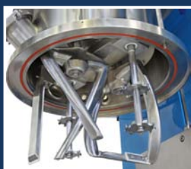
Two (2) High Viscosity "HV" Planetary Stirrers, Two (2) High Speed Shafts with Two (2) Disperser Blades each, and Sidewall Scraper Arm

As viscosity rises, however, even a multi-shaft mixer arrangement will eventually fail to produce sufficient flow. For example, the sweep agitator may simply carve a path through the viscous batch as agitation close to the axis of rotation becomes more and more limited.