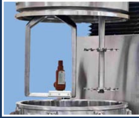
Rectangular Planetary Stirrer and High Speed Shaft with Two (2) Disperser Blades