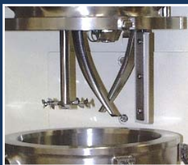
High Viscosity "HV" Planetary Stirrer, High Speed Shaft with Disperser Blade, and Sidewall Scraper Arm